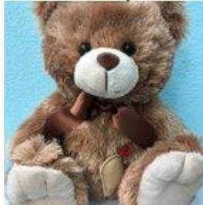
Ollie Teddy Bear

Ollie is a Teddy Bear with an Ostomy and he is being given to children who undergo ostomy surgery at Rush Hospital in Chicago. What a marvelous idea!